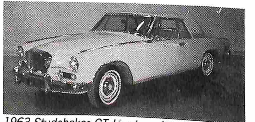
1963 Studebaker GT Hawk ... $8,500, p. 135