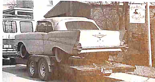
Peggy Sue ... off to the shop ... p. 6