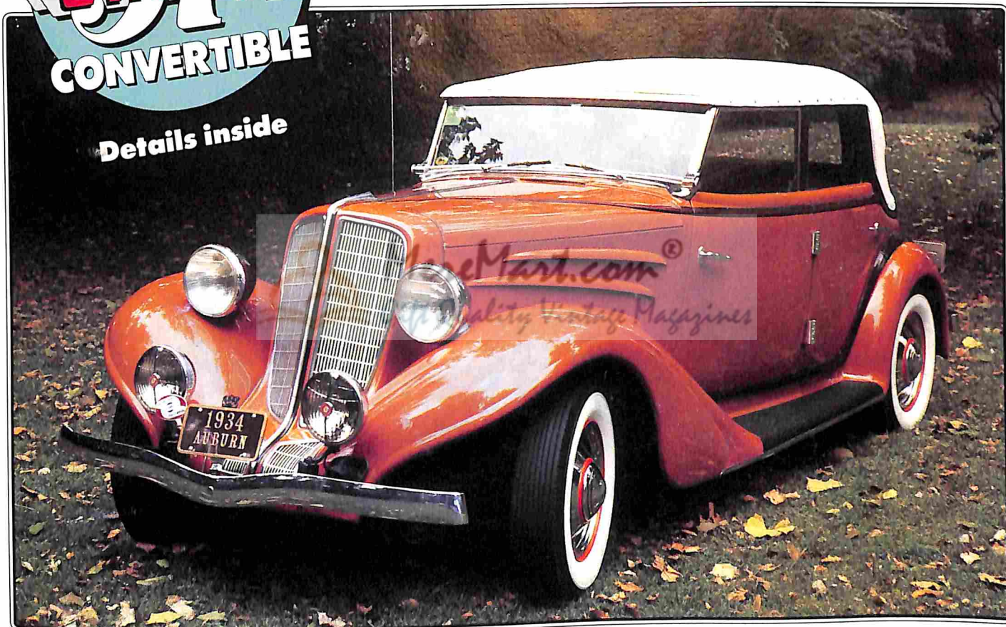
1934 Auburn 654 Convertible Sedan