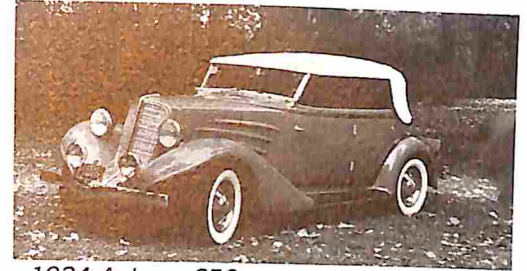
1934 Auburn 652 conv. sedan ... p. 20