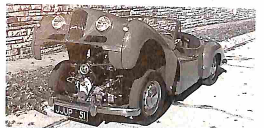
1951 Jowett Jupiter ... p. 48

SUBSCRIPTION RATES , monthly frequency: U.S. 12 issues $20.00, 24 issues $36.00, First Class 12 issues $42.00, 24 issues $80.00, other countries 12 issues $22.00, 24 issues $40.00. Air mail 12 issues $59.00, 24 issues $112.00. A free 20-word ad is given with each subscription or renewal for use any time during subscription term. Words in excess of 20 are 30¢ each. Allow 4-6 weeks for subscription start.