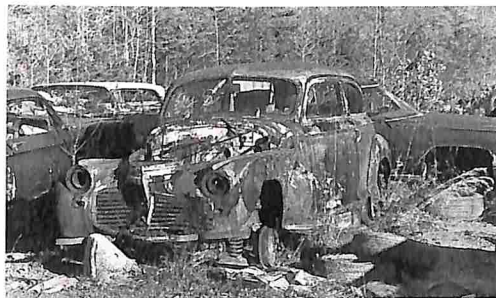
Prospect Auto Parts ... p. 62