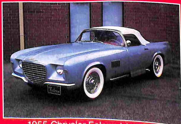
1955 Chrysler Falcon Idea Car