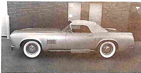
1955 Chrysler Falcon idea car ... p. 32