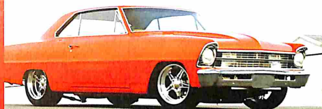
11-SECOND URBAN CRUISER