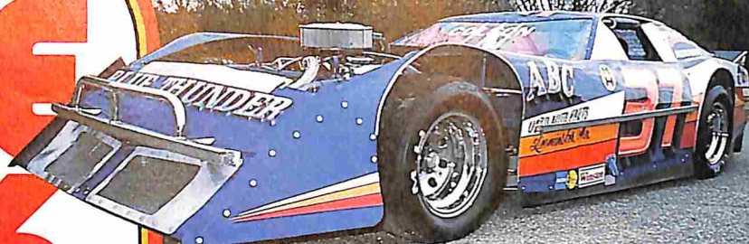
FRAN JUNIOR COLSON'S BLUE THUNDER PRO STOCK