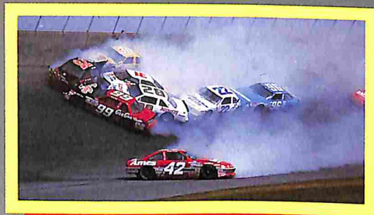
INCREDIBLE 23-CAR GN CRASH!