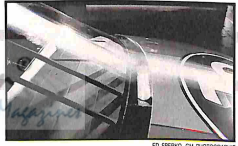
ED SPERKO, GM PHOTOGRAPHIC