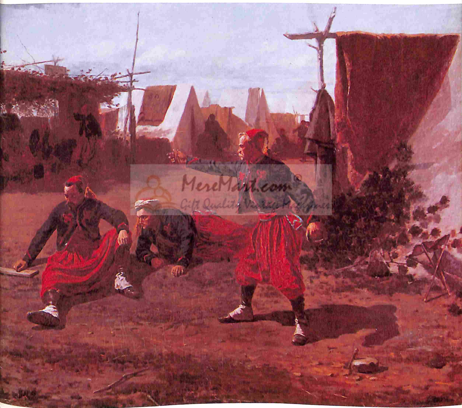
Pitching Horseshoes By Winslow Homer