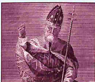
Culver Pictures, Inc.