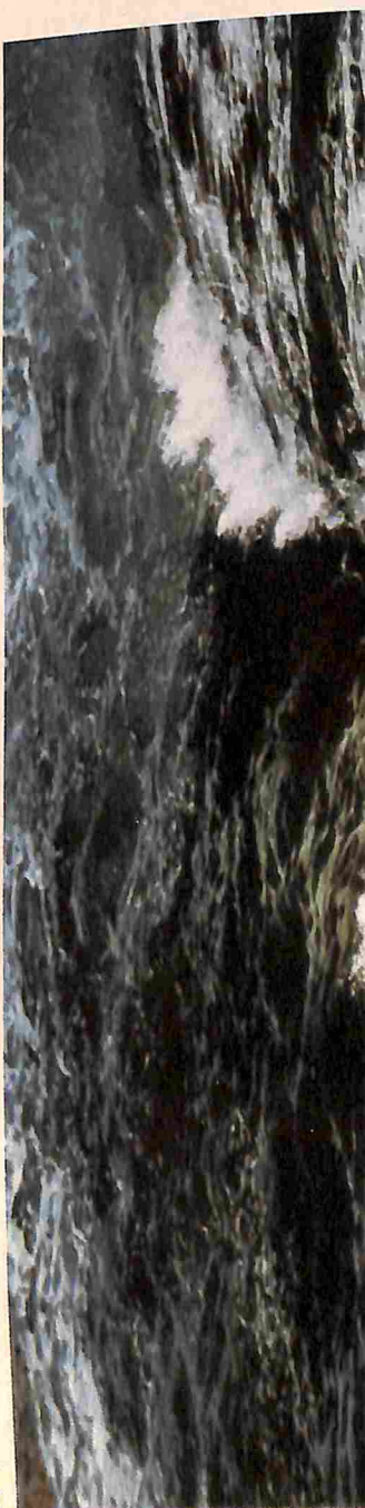
Picturesque San Juan, capital of Puerto Rico, site of eight-day Crusade beginning March 19