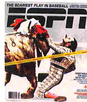
ILLUSTRATION BY SEAN MCCABE

108 AND ANOTHER THING Top recorded speeds of assorted sports projectiles.