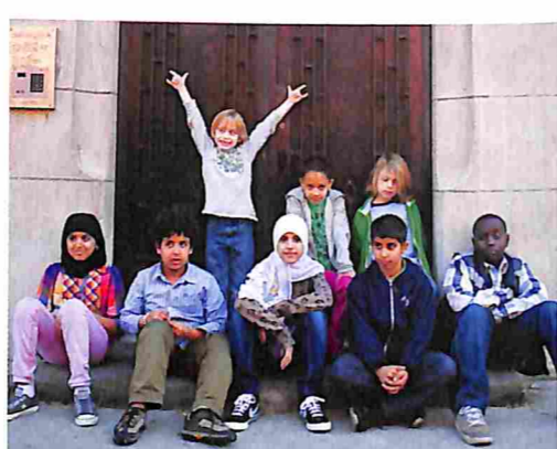
WYCKOFF PLACE Dir: LAURI FAGGIONI