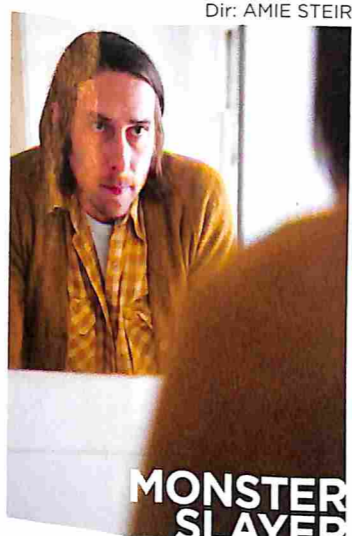
MONSTER SLAYER Dir: CASKEY