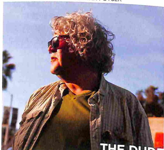
THE DUDE Dir: JEFF FEUERZEIG