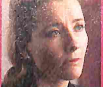
NAME OF FATHER