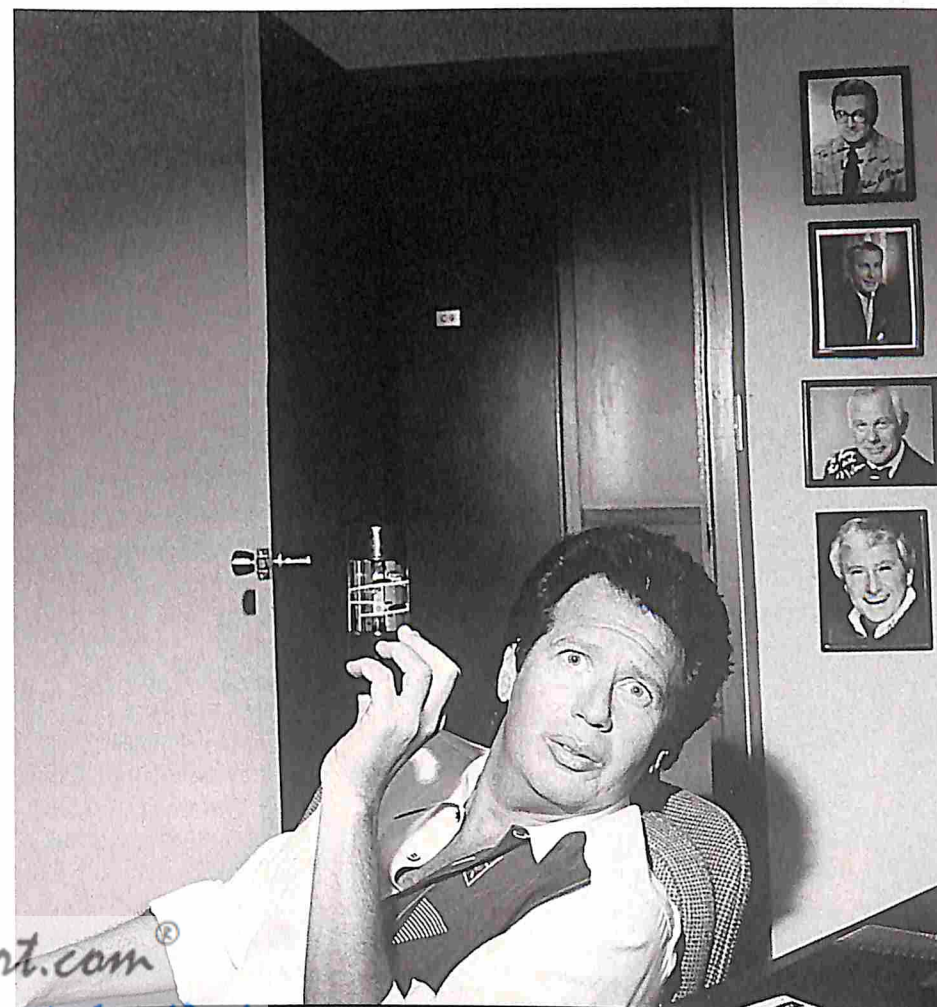
HOST WITH THE MOST Garry Shandling revisits his Larry Sanders alter ego in a mock memoir