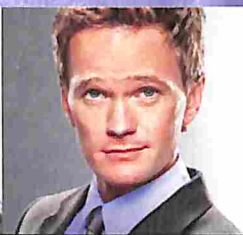
HOW I MET YOUR MOTHER