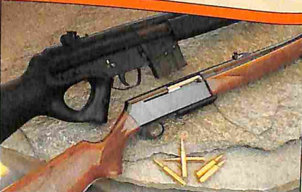
SEMI-AUTOS PAGE 72