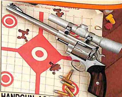
HANDGUN ACCURACY PAGE 56