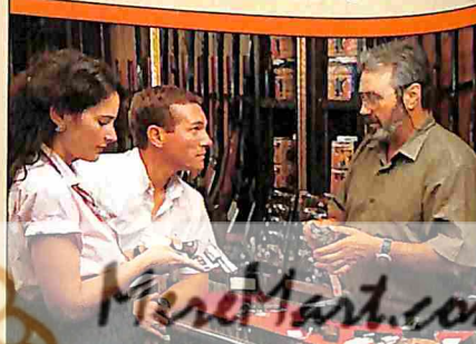
USED HANDGUN PAGE 50