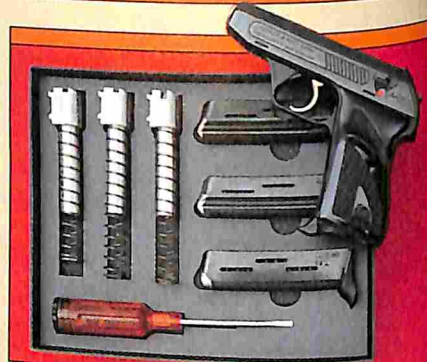
DOUBLE-DUTY HANDGUNS PAGE 40

GUNS & AMMO MAGAZINE, Copyright 1990 by Petersen Publishing Co. All rights reserved. CAUTION: Some advertisements may concern products that are not legally for sale to California residents or residents in other jurisdictions.