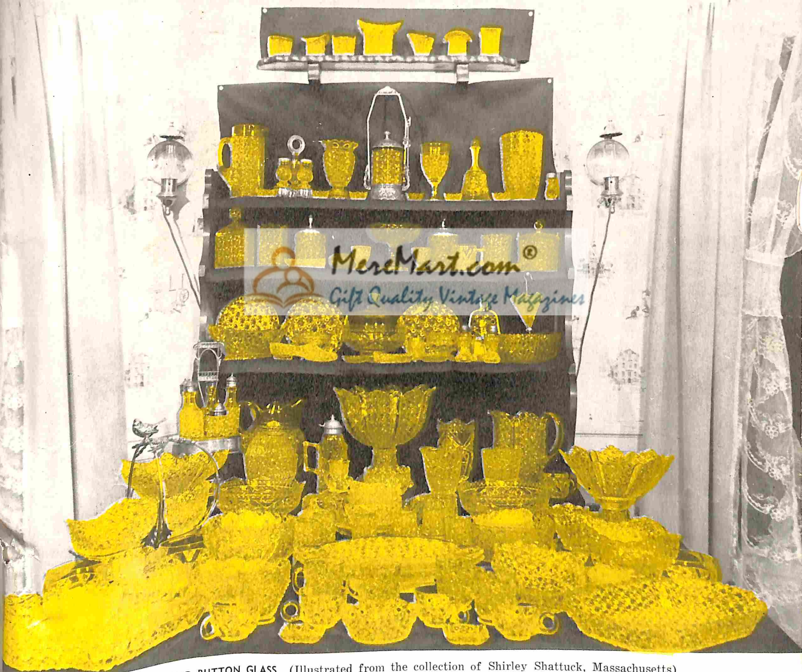
VASELINE DAISY AND BUTTON GLASS (Illustrated from the collection of Shirley Shattuck, Massachusetts)