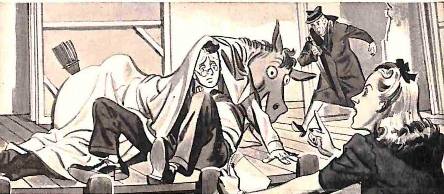
Lil: Arthur-that's a horse, not a hearse! Put some pep in it! Art: Aw, Lil! I didn't wanta be an actor.