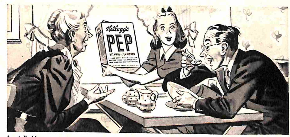
Aunt Patty: And don't let him forget it, Lil! Right in that crisp wheat-flake cereal, KELLOGG'S PEP, are extra-rich sources of two of the most important vitamins, the ones our diets are most likely to be deficient in, vitamins B1 and D. Art: Holy smoke, Auntie! It's delicious! Why haven't you told us about it before?