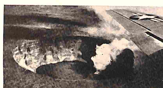
NON-STAFF CAMERAS RECORD A DISASTER IN ALASKA, A DEAD DUCK IN UTAH, A FROGMAN IN GREENLAND AND A VOLCANO'S BLAZING CRATER IN HAWAII