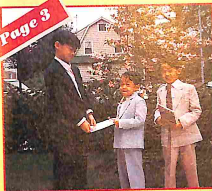
Immanuel Lutheran Church, Flushing, N.Y.