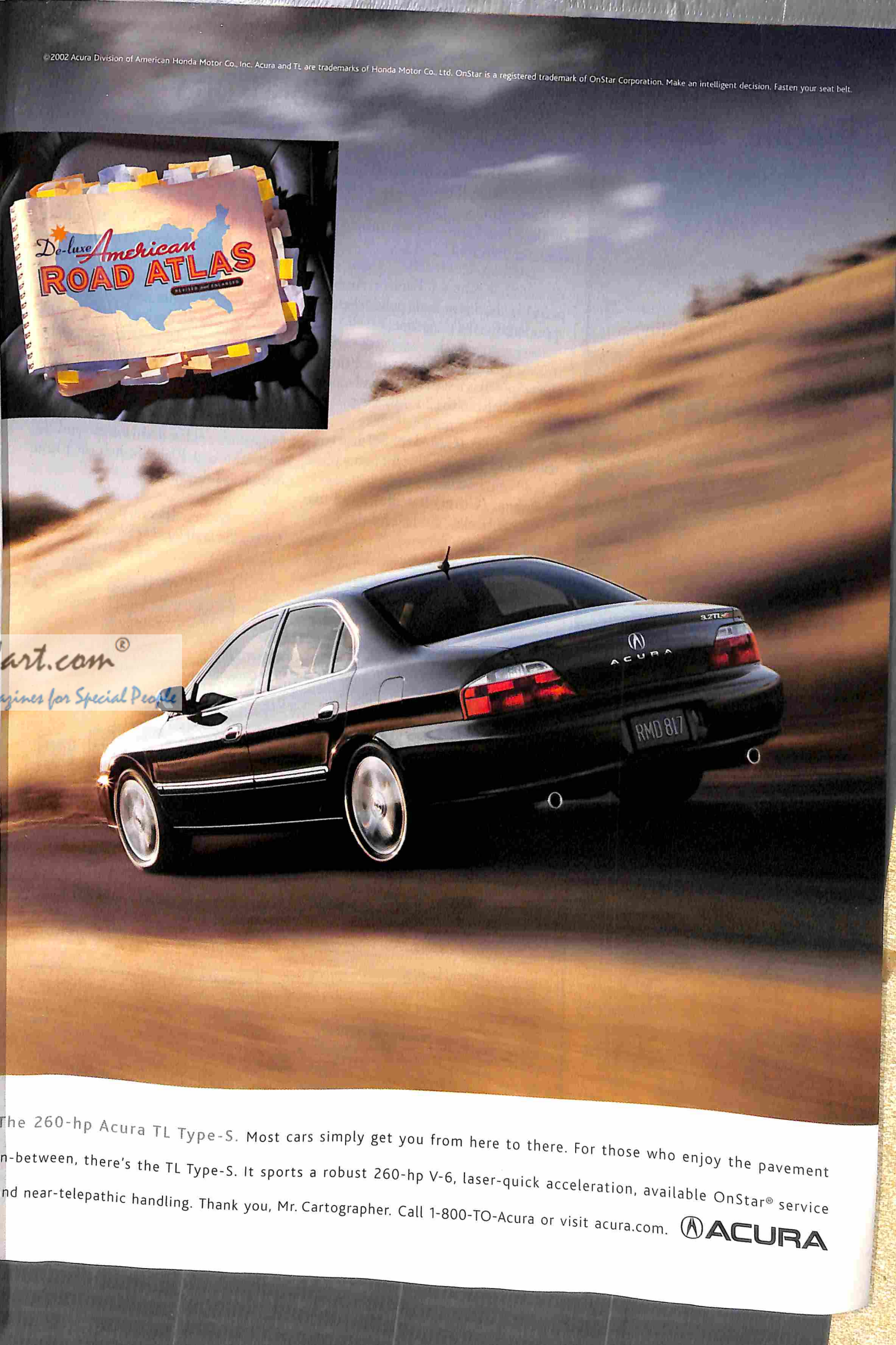
©2002 Acura Division of American Honda Motor Co., Inc. Acura and TL are trademarks of Honda Motor Co., Ltd. OnStar is a registered trademark of OnStar Corporation. Make an intelligent decision. Fasten your seat belt.

The 260-hp Acura TL Type-S. Most cars simply get you from here to there. For those who enjoy the pavement in-between, there's the TL Type-S. It sports a robust 260-hp V-6, laser-quick acceleration, available OnStar® service and near-telepathic handling. Thank you, Mr. Cartographer. Call 1-800-TO-Acura or visit acura.com . ACURA