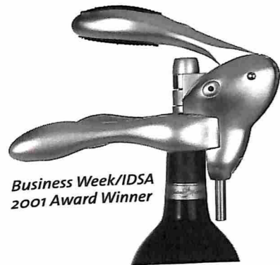
Business Week/IDSA 2001 Award Winner

THE NEW SILVER RABBIT® CORKSCREW WEARS A SHINING SUIT OF ARMOR