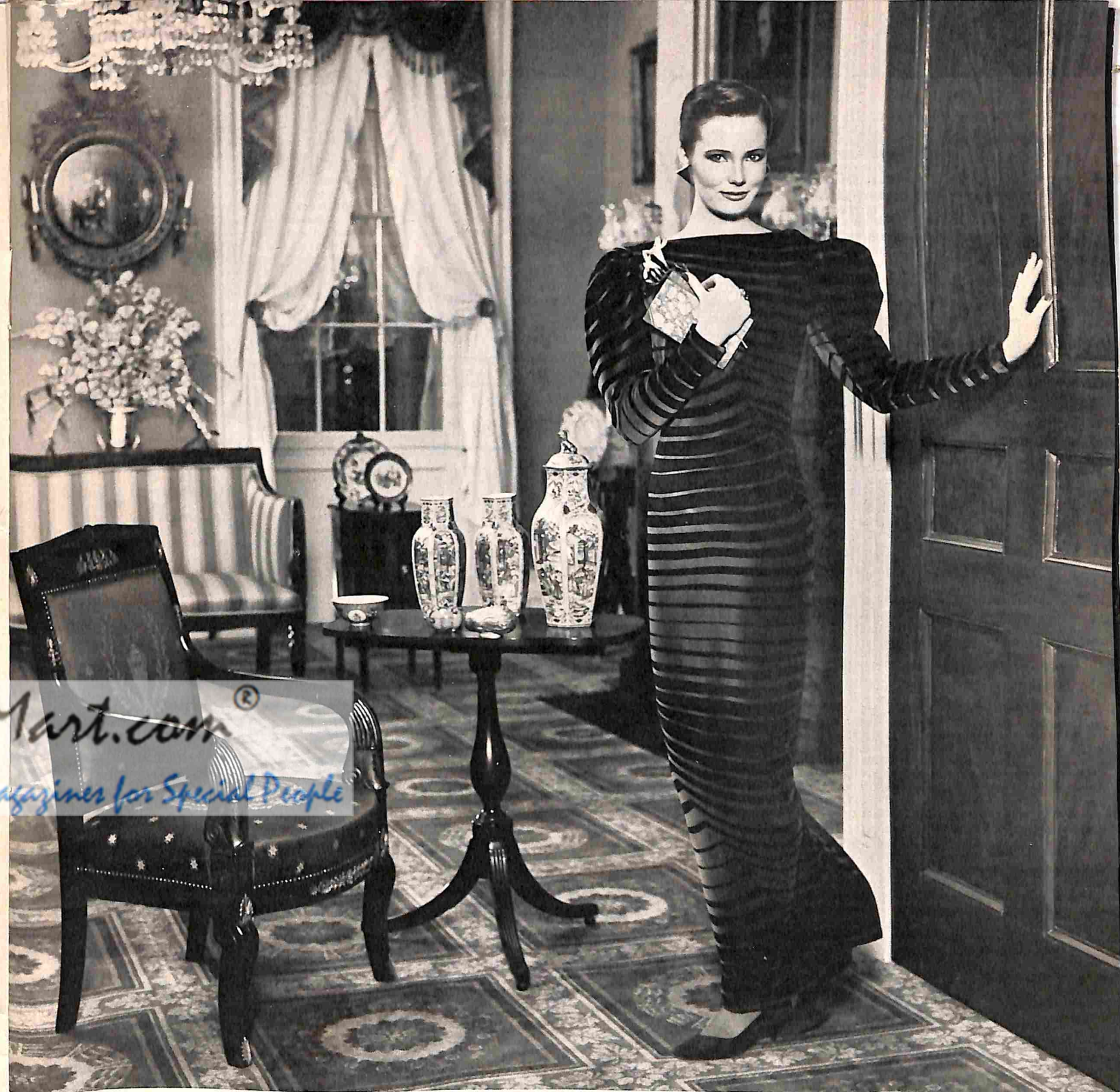
© 1984 Estée Lauder, Inc. Gown: Rizkallah Earrings: Stigi