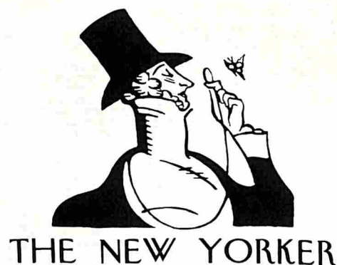
TABLE OF CONTENTS JULY 6, 1992

Rates are effective for occupancy 6/21-9/12/92. Taxes and gratuities additional. Subject to availability and change. Represented by Princess Hotels International, Inc. ®