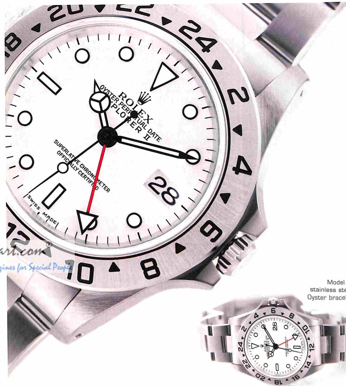
Model in stainless steel. Oyster bracelet.