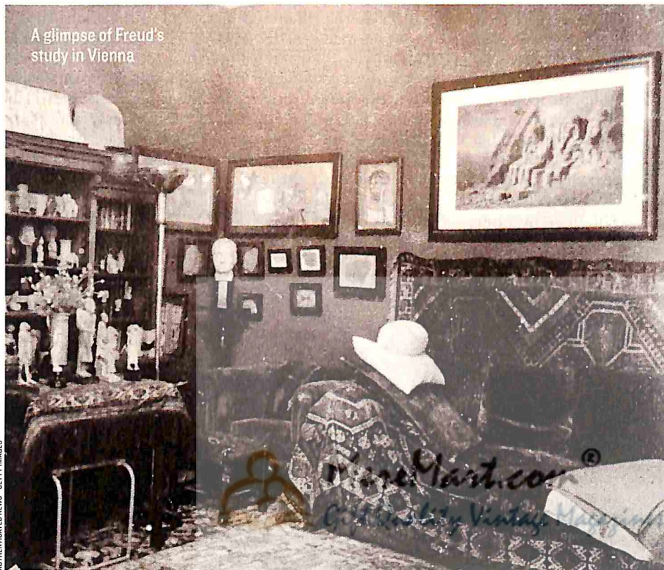
A glimpse of Freud's study in Vienna