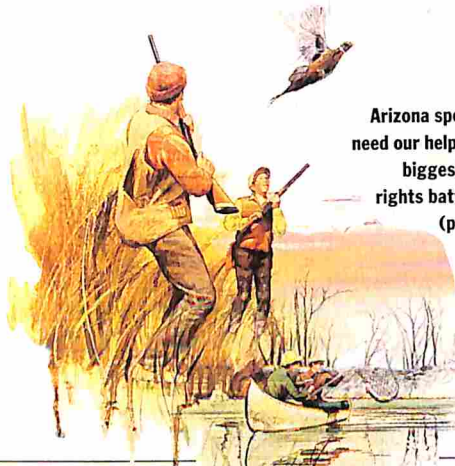
Arizona sportsmen need our help in their biggest animal rights battle ever. (page 40)