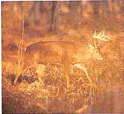
Big bucks are masters of elusion. But you can take the best that have fooled the rest. (page 38)