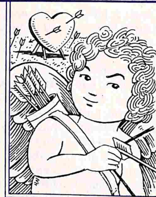
Be my Valentine, 24