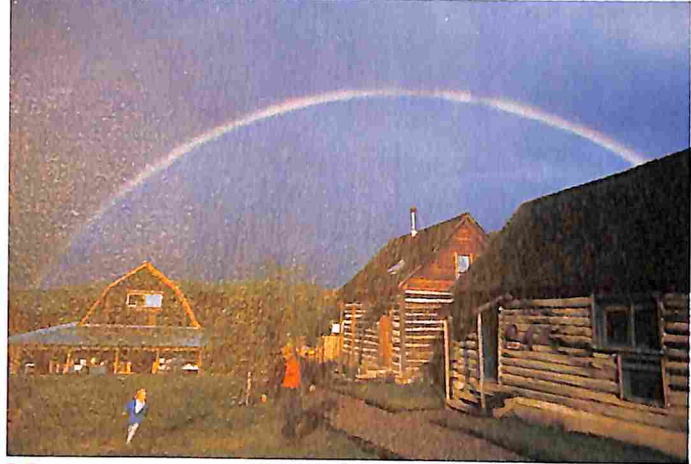
80 Chasing rainbows

68 Find this Leica lookalike and lots of other new products in our report on the PMA photo show.