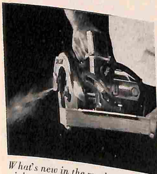
What's new in the marketplace? PS picks out the best and most useful items—like this pivot-guard saw—and tells you all about them.