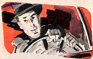
New tires and devices—now on the way—will put firmer feet under your car... but the best skid preventive? Those pro tricks that mark the skilled driver.