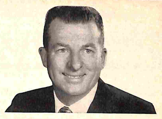
Sam Hanks, Indianapolis "500" champion and driving safety expert, says-

PS Readers Talk Back • 6 Science Newsfront • 29 I'd Like to See Them Make • 97 New Ideas from the Inventors • 146 Wordless Workshop • 194