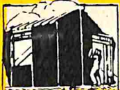
Learn how to sheathe cottage in 2 days.

Learn about Woods, Veneers, Plywoods. Valuable tricks of the trade; all about tools. How to make various wood joints.