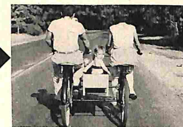
Papa-plus-Mama power propels a bicycle built for four.