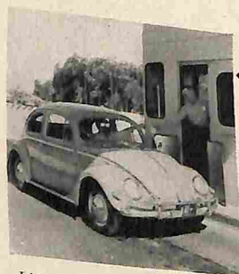
Little $1,495 VW challenges $10,000 Continental's time from Chicago to New York