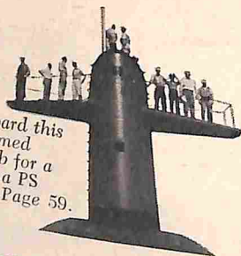
Come aboard this Polaris-armed atomic sub for a ride with a PS reporter. Page 59.