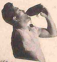
Thirsty? That's an SOS that your body's salt balance is out of line. Page 82.