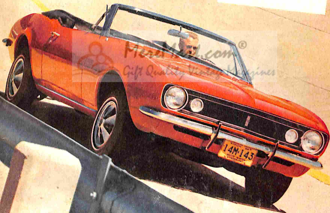
CAMARO, Coming and Going