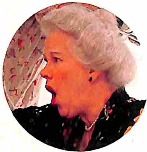
▲ PAGE 36 Win By Losing