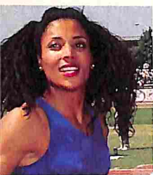
▲ PAGE 62 Transcending Her Limits