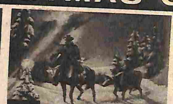
T905 Outdoor Temple - Greeting is an appropriate verse by S. Omar Barker - Lenox