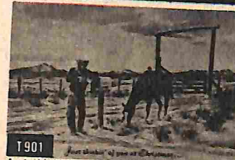
T901 Just thinkin' of you at Christmas - With Best Wishes for a Happy Holiday Season - Long