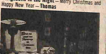
T926 Counting Our Blessings - Merry Christmas and Happy New Year - Nicles