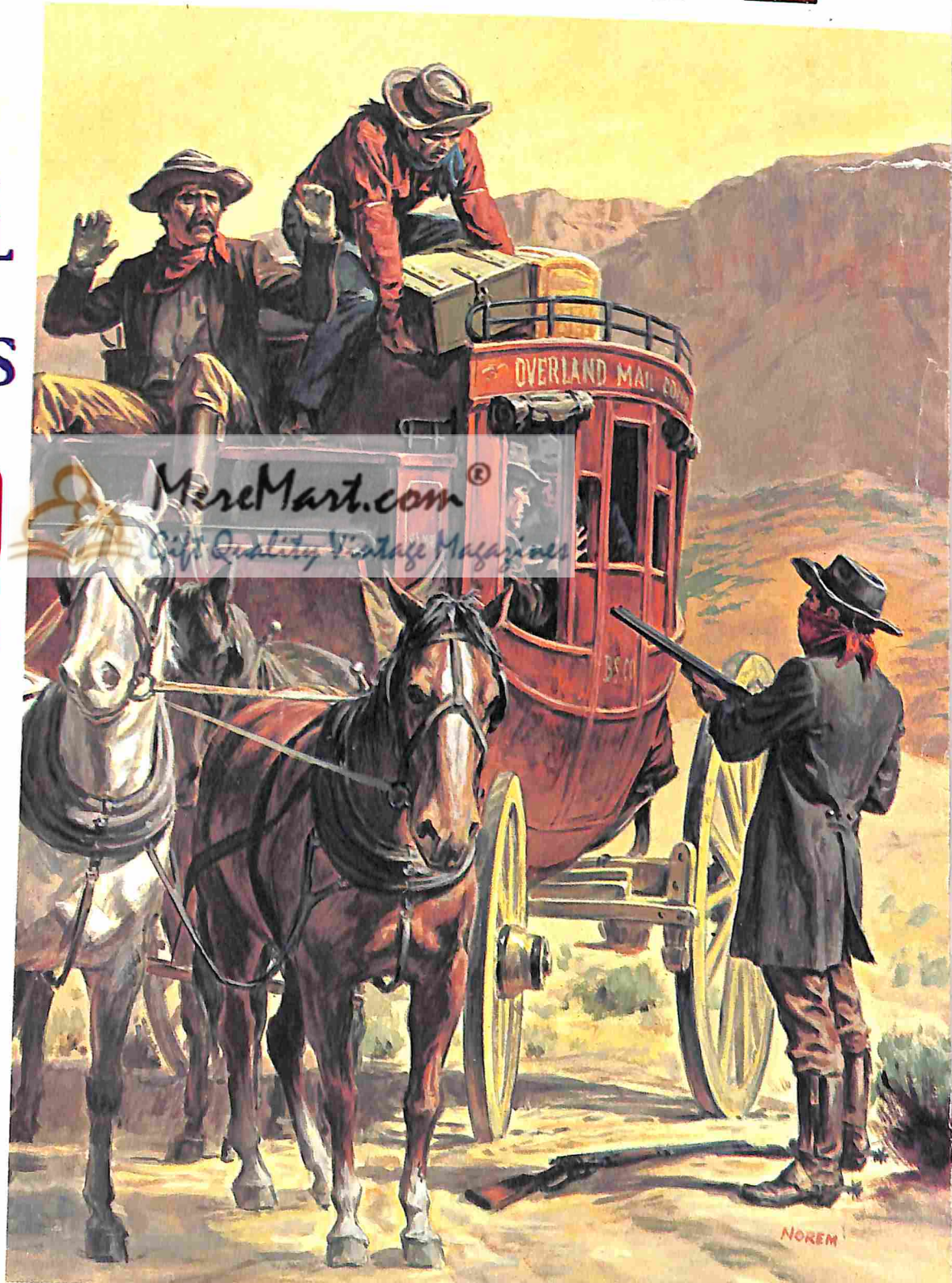
"TOSS DOWN THE STRONGBOX" by Earl Norem