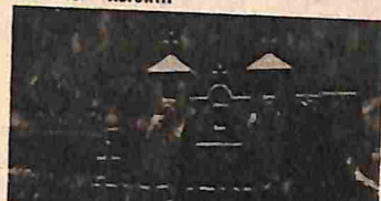
T909 Christmas Eve at Ranchos de Taos - To wish you a Blessed Christmas, etc. - Gomez