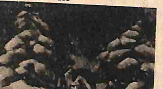
T929 We hope your camp is safe and warm, etc. - Greeting is 4 line verse - FitzSimmons