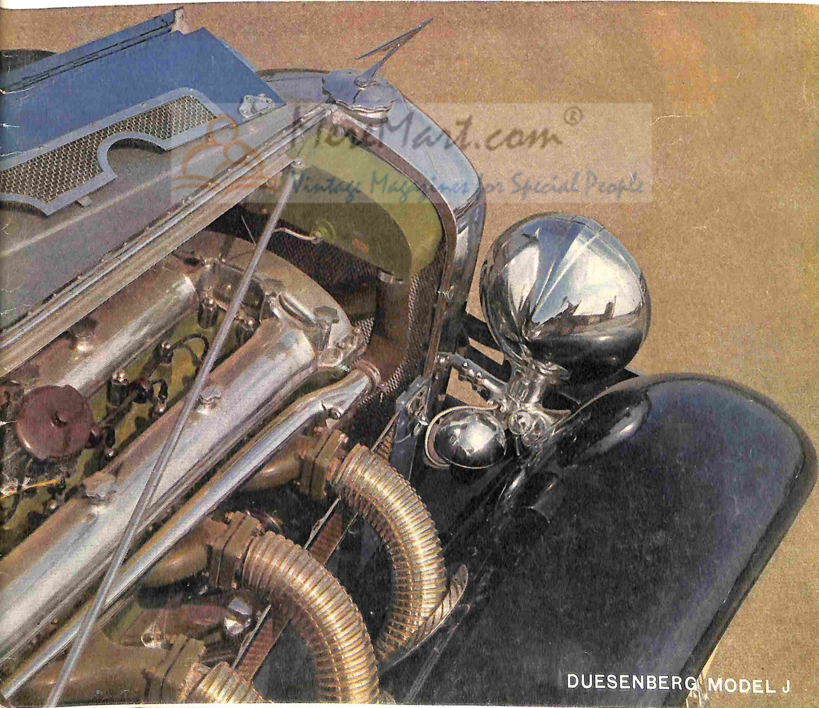
DUESENBERG MODEL J

Karting; Its start, development and growth Competition; Portuguese Grand Prix, Road Tests: 1961 Volkswagen, Mercedes 190 SL, Toyopet Tiara—newest car from Japan