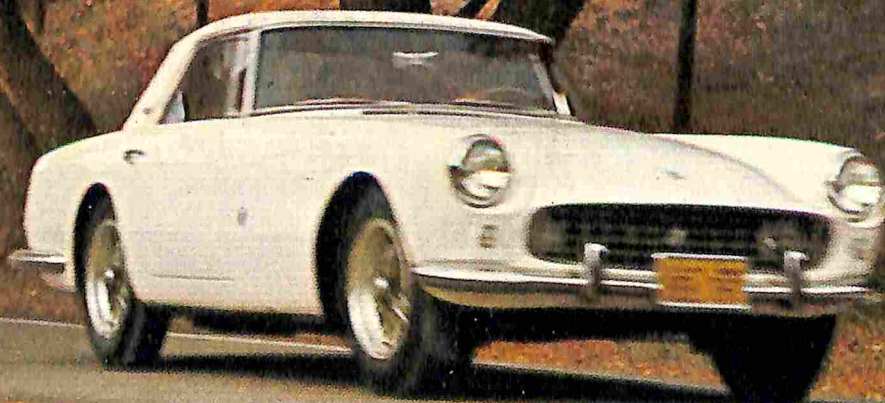
FERRARI 250 GT FARINA COUPE