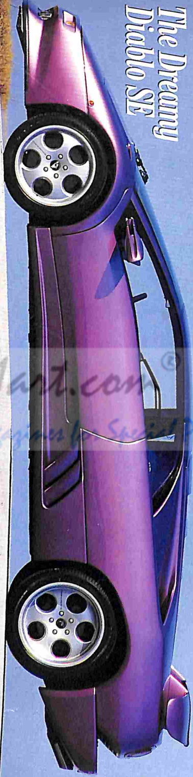
The Dreamy Diablo SE