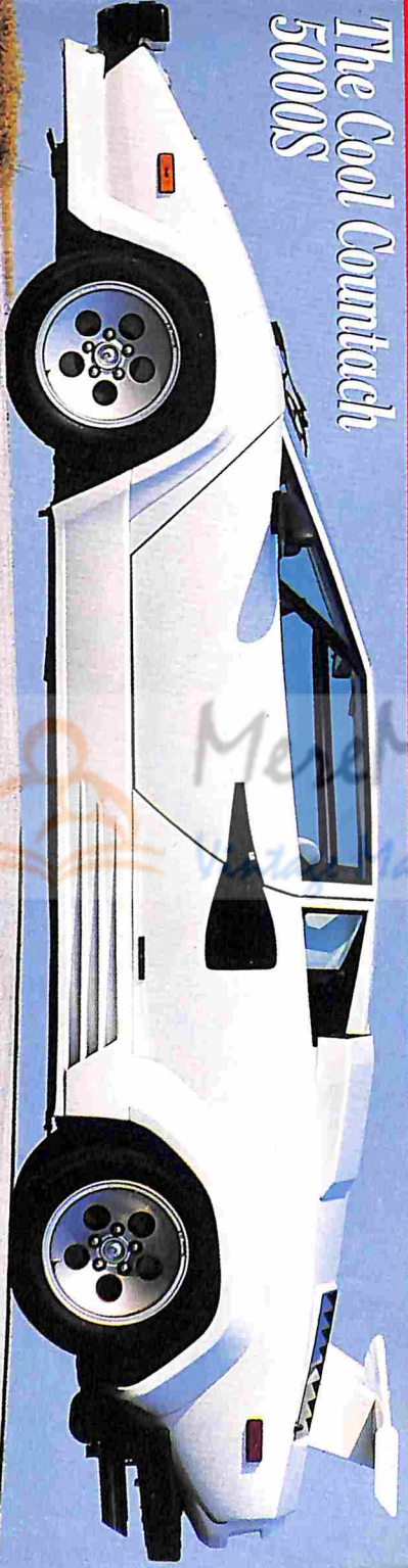
The Cool Countach 5000S