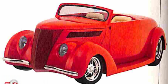
50 THIS '37 ROADSTER SHOWS YOU WHAT IT TAKES TO WIN THE NATION'S TWO MOST PRESTIGIOUS HOT ROD AWARDS.