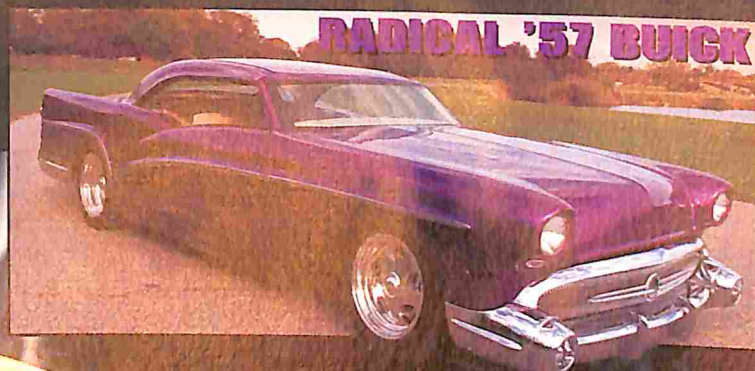
RADICAL '57 BUICK