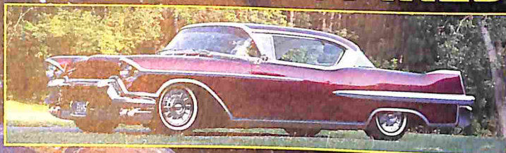
'57 Candy Caddy