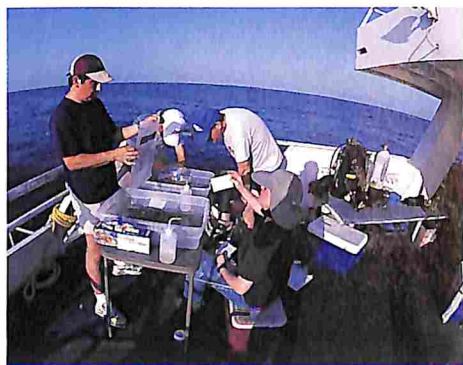
50 Researchers (on an oil platform in the Gulf of Mexico) study marine life for new drugs.

—"YELLOWSTONE: IN THE BEGINNING," PAGE 80