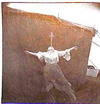
68 Diane Arbus looked upon circus performers as near mythic figures.