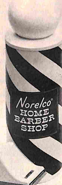
30 days of close Microgroove™ shaves on penlight batteries. Norelco Cordless 'Flip-Top' Speedshaver® 20B. Comes in mirror wallet.