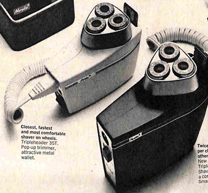
Twice as many shaves per charge as any other rechargeable. New Rechargeable Tripleheader 45CT. Shaves with or without a cord. More features. Smart travel wallet.