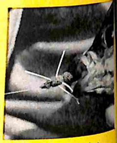
page 56: tactics to try for finicky bluegills