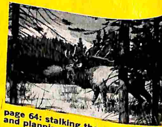
page 64: stalking the wapiti and planning a trophy elk hunt