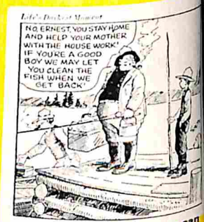
page 50: all fly-fishermen can relate to these classic cartoons