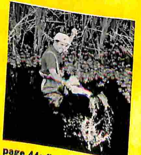
page 44: fly-rod methods for jumbo largemouths