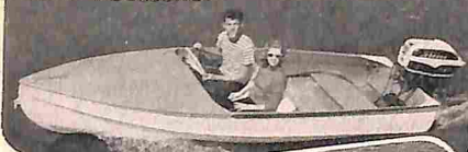
New Custom "Sportsman"