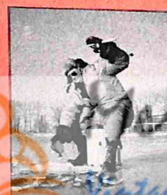
Page 41: productive fishing during winter months