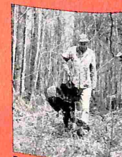
Page 58: a day's drive to turkey hunting

One of a continuing series, Remington Reports