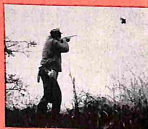
Page 54: all about winter crow migrations