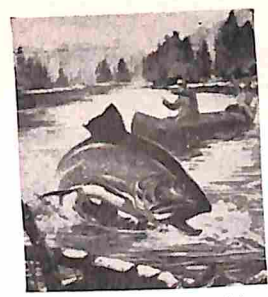
Cover by Howard Whims