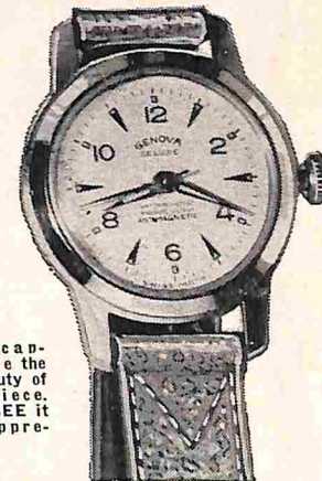
Illustration cannot capture the elegant beauty of this timepiece. You must SEE it to really appreciate it.