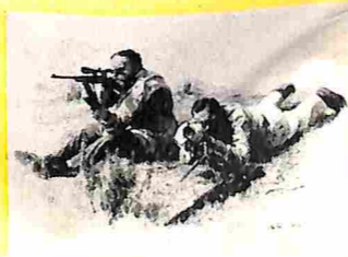
page 72: expert advice on rifles for summer shooting

One of a continuing series. Remington Reports