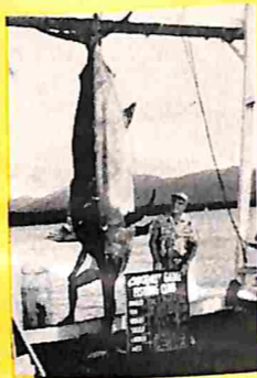
page 64: where to go for record marlin