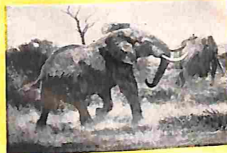
page 48: the amazing story of the elephant