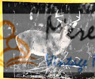
page 43: a method of bowhunting that saves game