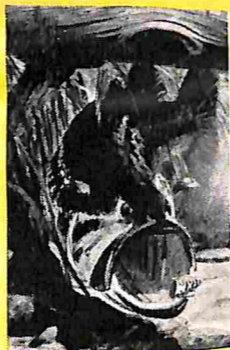
page 50: scientific facts for lunger busting