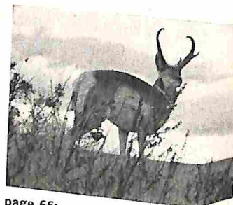
page 66: everything you need to know for a fall antelope hunt