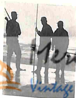
page 68: how to find and catch fish in the surf