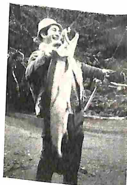
page 64: techniques for West Coast steelhead