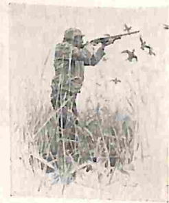
page 76: how much do you know about waterfowling