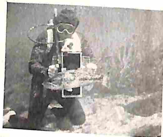
page 51: the most thorough study of the bass ever undertaken